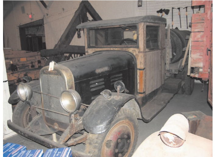
1929 Brockway EC model stored away since 1976