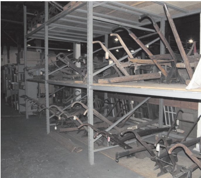
Miscellaneous plows dating back to the 1700s stored away in steel racks

Since our main objective was to see all of the trucks the museum has acquired throughout the years, our first stop was at two trucks sitting next to each other. The first was a 1929 model 'EC' Brockway powered by a Wisconsin engine. Inside the cab, located in the middle of the dashboard, was a plate marked, 'Kabs by Kenyon - Albion, NY - serial #26'. This