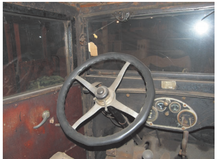
Inside the cab of the 1929 Brockway EC model. A plate in the middle of dash reads, 'Kabs by Kenyon. Apparently this cab was manufactured by someone other than Brockway'